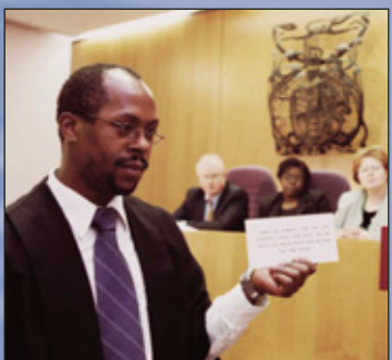
Taking the oath in a magistrates' court.

Each year CPS Warwickshire handles around 11,500 magistrates' court cases including cases referred for advice and 550 Crown Court cases. In 2005-6 our average conviction rate was 91.5% in the magistrates' court (the highest in the country) and 88.4% in the Crown Court (again the highest in the country).